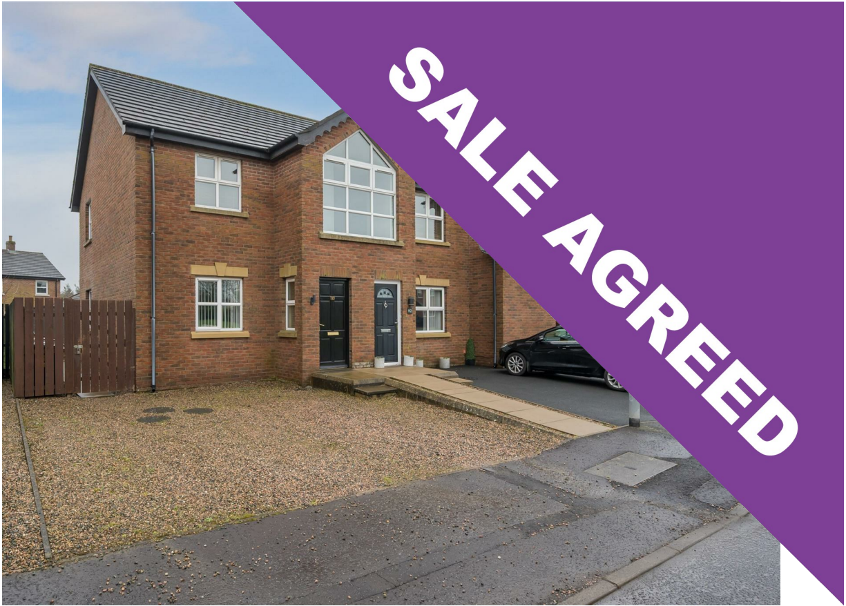
110 Gateside Manor, Ballyclare, BT39 9GA