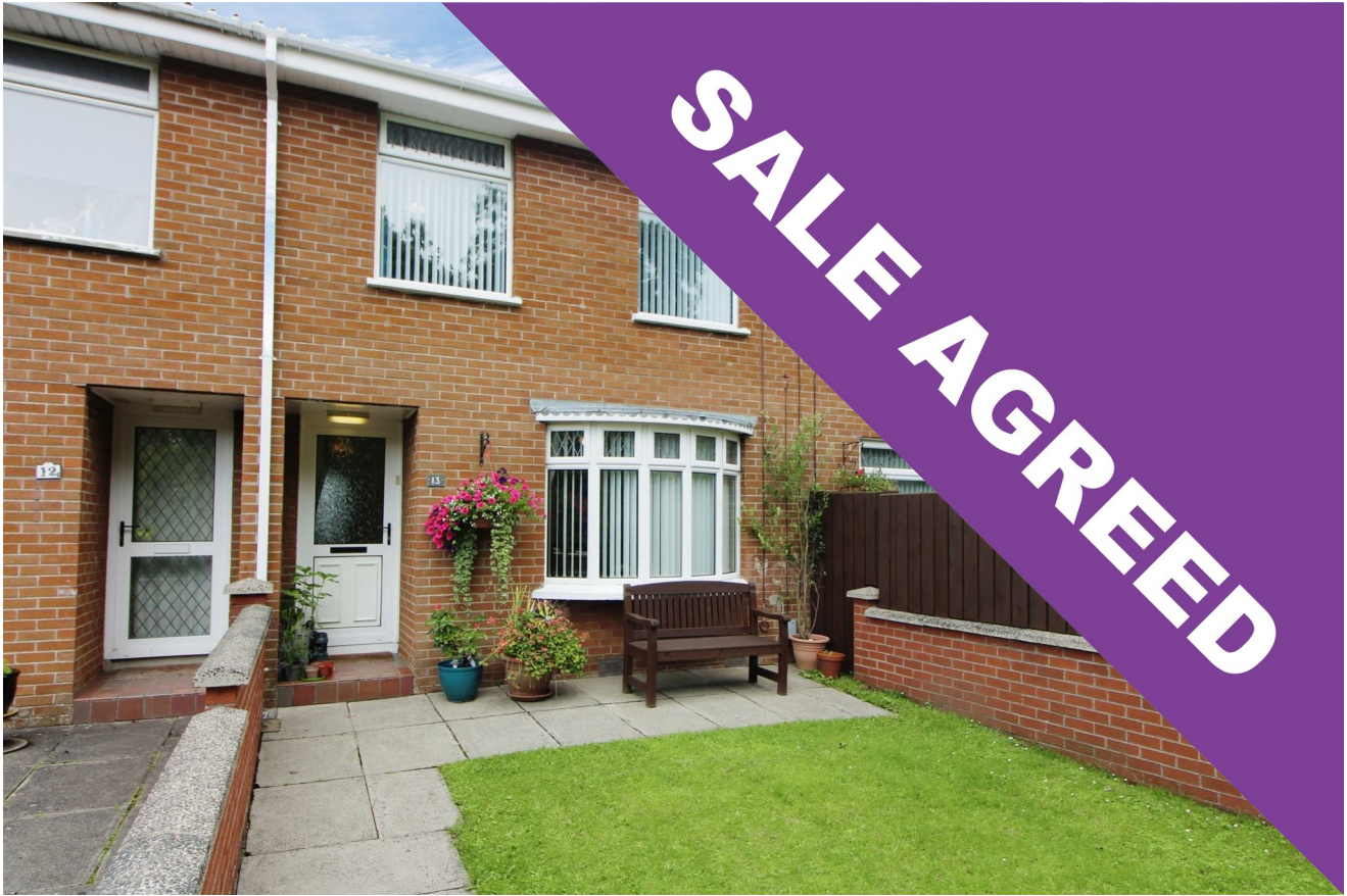
13 Abbey Green, Newtownabbey, BT37 0EF