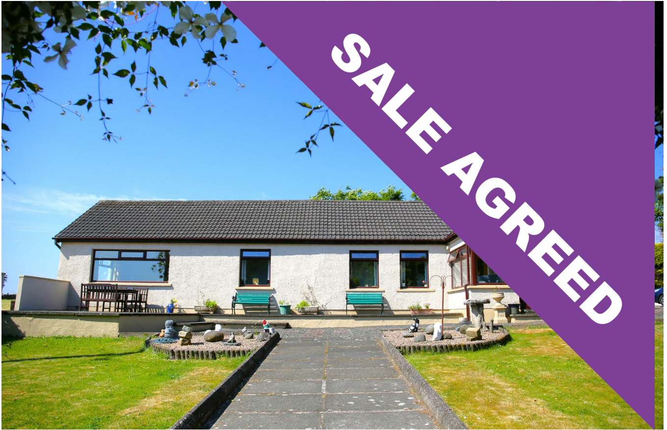
'Hillcrest View', 69 Cairn Road, Carrickfergus, BT38 9AP